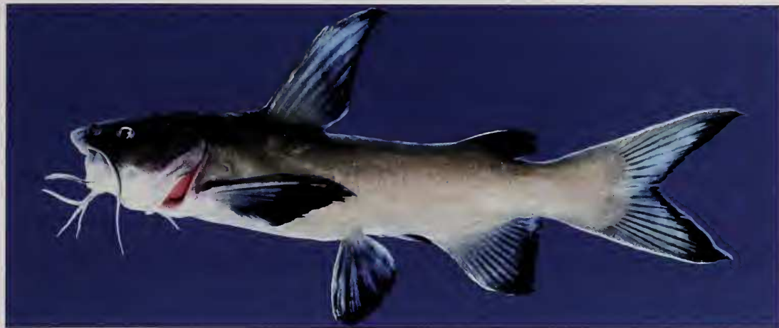
Fig. 3. Galeichthys trowi , paratype, 145 mm SL, juvenile male, SAIAB 45967, Anchor Reef, KwaZulu-Natal.

Additional material. RUSI 40640 (2), males, 314 and 322 mm SL, KwaZulu-Natal Province, Park Rynie, Landers reef, 4 km offshore, 5 Aug. 1992, collected by C. Buxton, P.C. Heemstra and others; RUSI 43345 (11), 225–435 mm SL, Scottburgh (KwaZulu-Natal Province) to Port Edward (Eastern Cape Province), from shore, 2–3 Oct. 1993, collected by Rudy Van der Elst for the Oceanographic Research Institute (ORI), Durban; RUSI 63684 (3), 390–410 mm SL, Transkei coastline, Eastern Cape Province, 1983, collected by E. Trow Sr.; RUSI 63685 (3), 395–445 mm SL, Coffee Bay, Transkei coastline, Eastern Cape Province, 1984, collected by E. Trow Sr.; RUSI 63686 (6), 305–450 mm SL, Transkei coastline, Eastern Cape Province, 1985, collected by E. Trow Sr.; RUSI 63687 (7), 335–470 mm SL, same data as holotype.